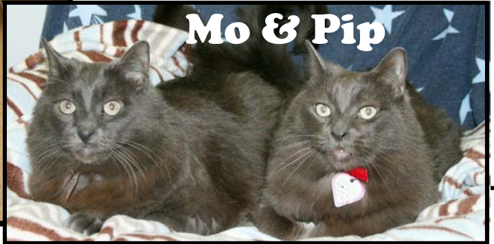
Mo & Pip

All of these awesome senior cats (and more) are available for adoption, so stop into S.A.R.A.'s Treasures to meet them soon!