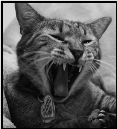
Angus - Available for Adoption