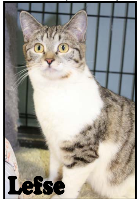
A healthy Lefse waiting to be spayed.

Luckily, all of the cats are doing great, and unlike at traditional shelters, no one was killed because of a fungus.