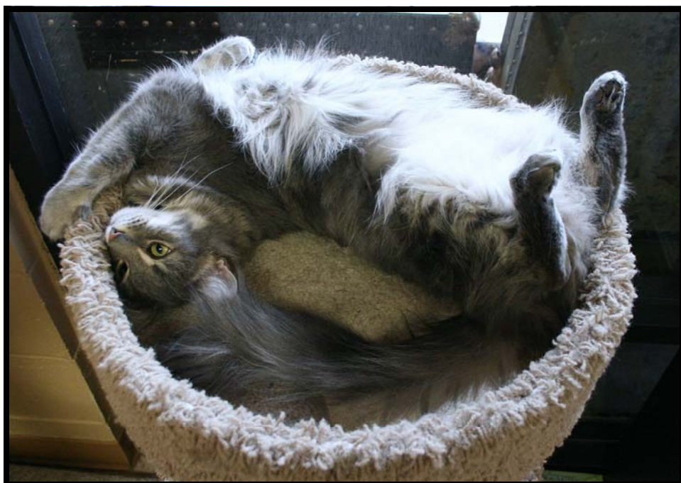
Bill enjoying the sunshine from the safety of his cat tree.

Pets need access to fresh, cool water at all times.