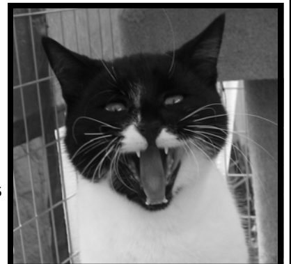
Gonzo - Available for Adoption

Donated items can be dropped off at S.A.R.A.'s Treasures 10:00-6:00 Every Day