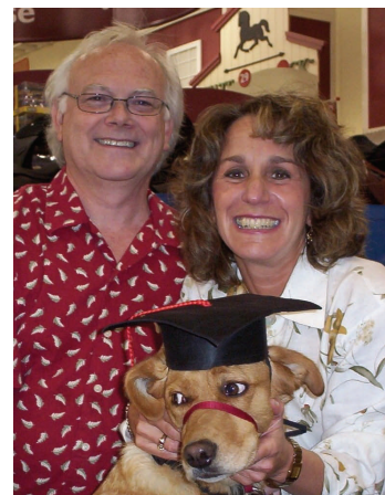
Me graduating from Dog class with Mom & Dad

Cuddling with mommy when she comes home from work is her favorite thing. She also enjoys taking her mommy on a run every morning, and Daddy on a walk every evening. Foxy is a very, very special addition to our family."