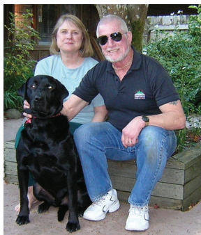
Here they are - I couldn't be happier!!