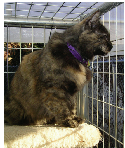
Harriet watching the birds....

For people and cats who believe in an indoor/outdoor lifestyle, this arrangement is ideal – it keeps us cats safe from cars, dogs and other hazards, while allowing us to enjoy the great outdoors and indulge in two of our favorite hobbies – birdwatching and flycatching. The neighborhood birds have voted our enclosure as "Best New Idea for Cats", too!"