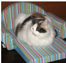
Enjoying my new kitty sofa

Thank you for all of your help in saving me and helping me get the good life I have now!"