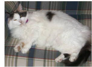
How can you resist this beautiful belly?!

"When the S.A.R.A. cat ladies came to LCARA this summer to check up on the cats, they saw 3 tiny kittens huddled in a cage. That was us!