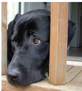
Waiting for my forever family.....