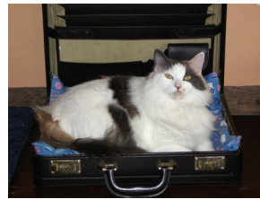
My Mom's briefcase makes a nice cat bed