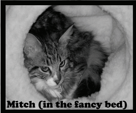
Mitch (in the fancy bed)

Mitch is full of love and adores being petted. He's the only one who ever sleeps in the fancy cat bed I bought - everyone else prefers to sleep on any section of newspaper that's been left lying on the floor. He is the most timid of the bunch but he enjoys getting brushed. He has finally realized that sleeping on the people bed is a good thing and that the "big scary thing that moves under the covers" is me.