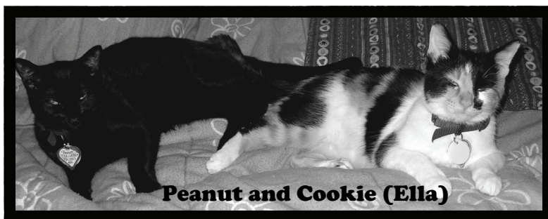
Peanut and Cookie (Ella)

Miss Ella-belle is the princess of the bunch. She likes to cuddle but definitely requires her alone time too. She is so soft and yet so vocal, she's usually the one who rats Peanut out for being on the counters. She loves to play and has a knack for getting her toys "lost" under the furniture. I used to worry that Peanut was playing too rough with her until I saw her launch herself off the sofa and try to eat his head.